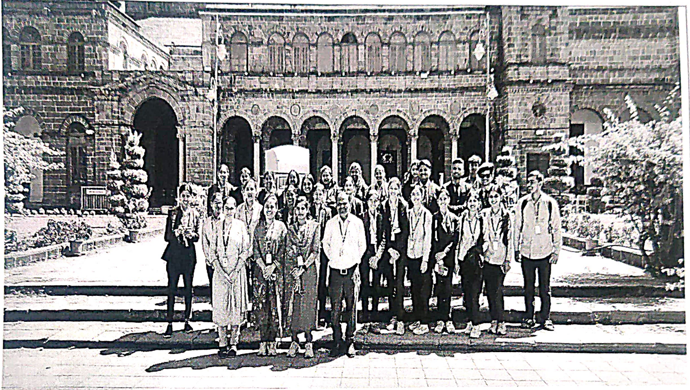
SPPU Visit Group Photo