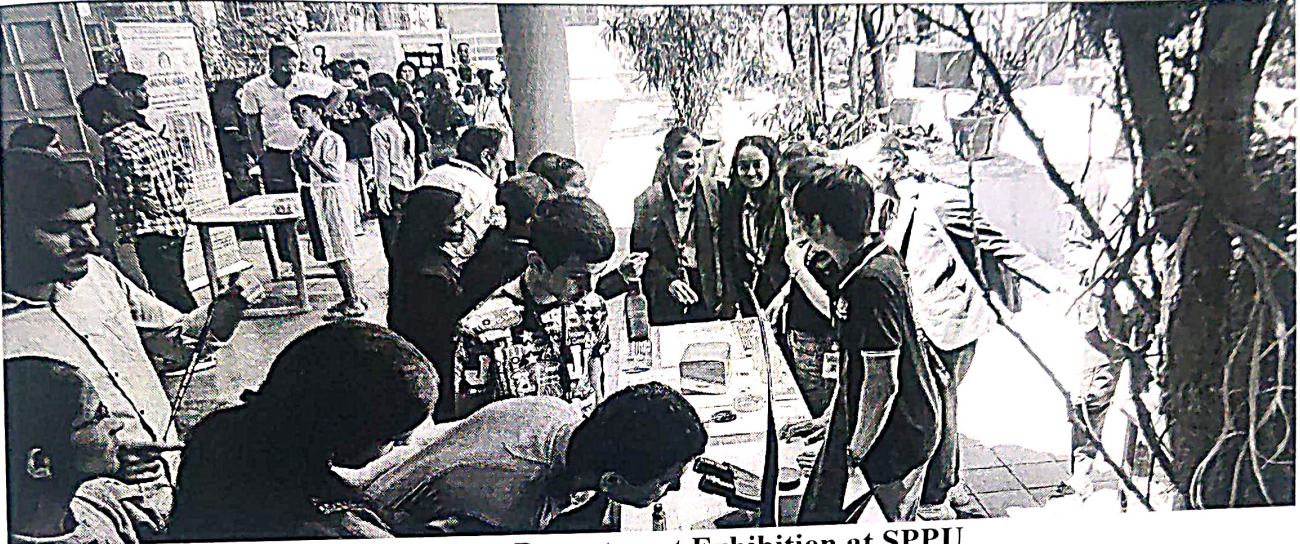
Chemistry Department Exhibition at SPPU